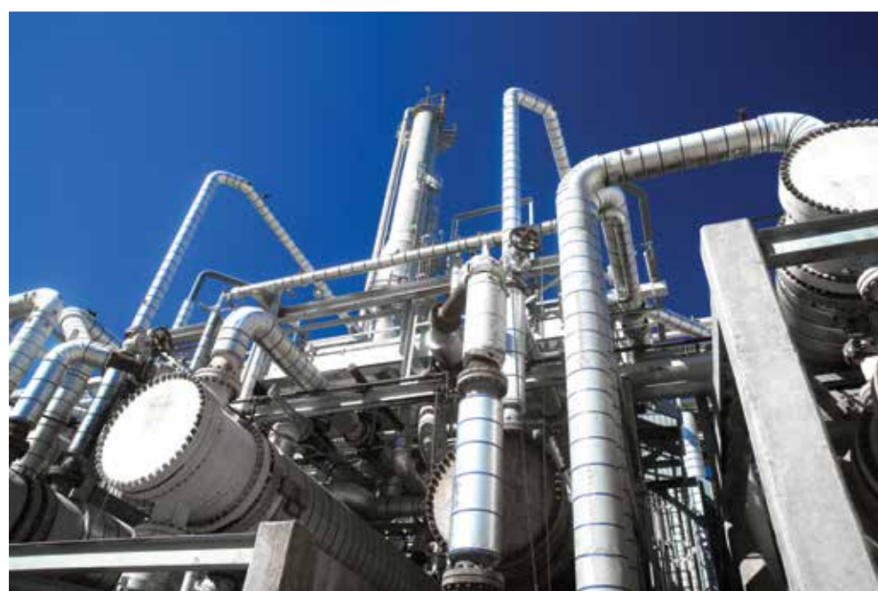
SMT tubes being used in a chemical plant.

with them and it is because of them we are always discovering new products and solutions that will bring them value. Working closely with the customers is the entire base of the company as outlined in the core values that date from 150 years ago."